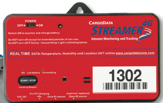
Actual size: 5.5" x 3.5" x .75"